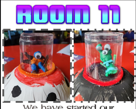
We have started our journey